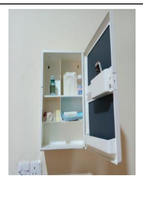
3- First aid indoor kit box