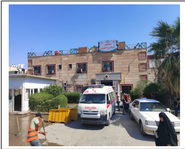
1- Al- Refaee teaching hospital

Health infrastructure facilities for students, academics and administrative staffs' well-being