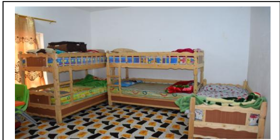
2-An example of the Student housing site in UOS