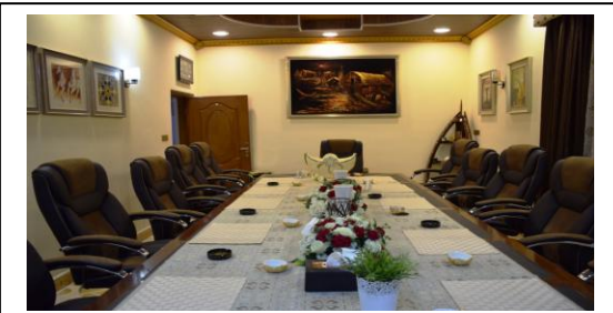
1-An example of the Academic staff housing