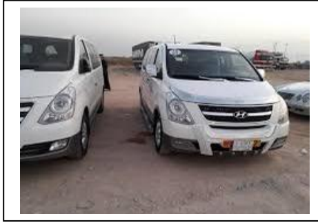
3-minivan used for staff services