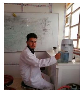
3- Microbiological evaluation of multiuse water, College of Basic Education.

Most of UOS faculties have its own laboratories with very advances devices with their technicians. Multiuse water is regularly monitored and evaluated for each use purpose. Many reports and scientific papers are published monthly about water quality of Al-Gharaf River which is considered as the lone and the important source of surface water in the area that UOS was located. Also, ground water is monitored from time to time. Visit the link below: https://scholar.google.com/citations?user=2YLTZRgAAAAJ&hl=en