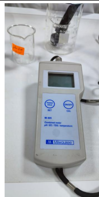
2- Physical and chemical evaluation of multiuse water, College of Science.