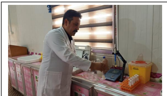
1- Regularly drinking water monitoring, College of Agriculture.